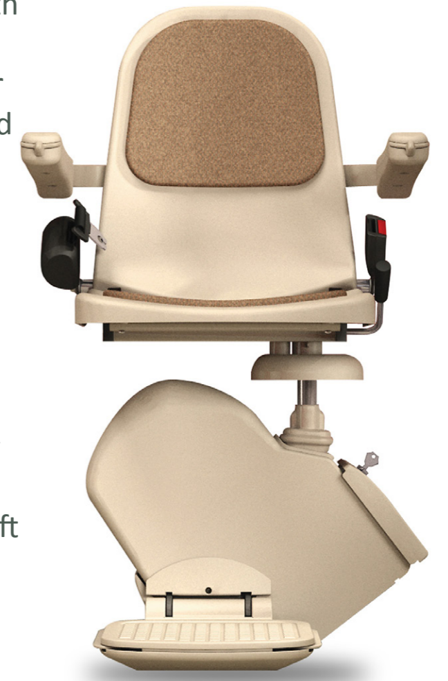
The Lincoln straight stairlift