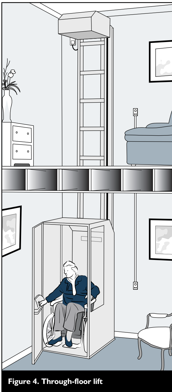
Figure 4. Through-floor lift