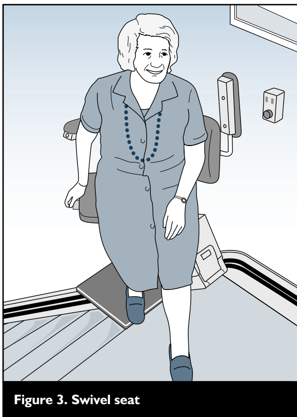
Figure 3. Swivel seat