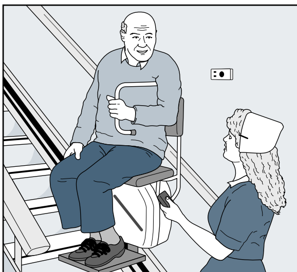
Figure 1. Seek good advice.

The booklet stresses both the need for professional advice before you make a decision, and the need to enquire about any available grants for equipment or conversions before any work is started. It includes useful addresses to help you do this. In most areas informed advice is available from community occupational therapists (OTs), who are usually based in the Department of Social Services of the local council (see the section ‘Who to ask’).